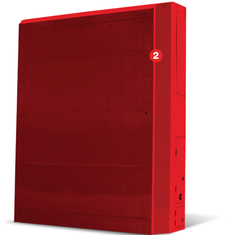
BACK OF CAB