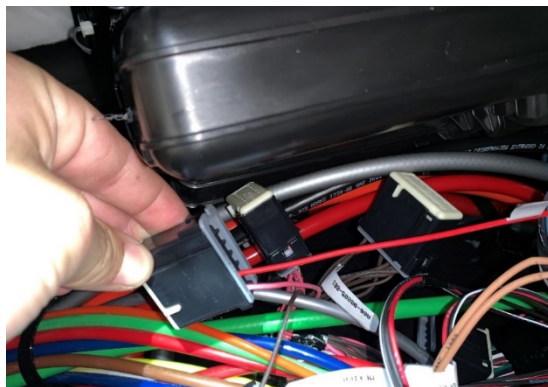
Figure 3: Switched Power Gauge Block