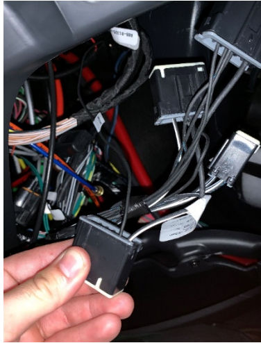
Figure 3: Ground Splice